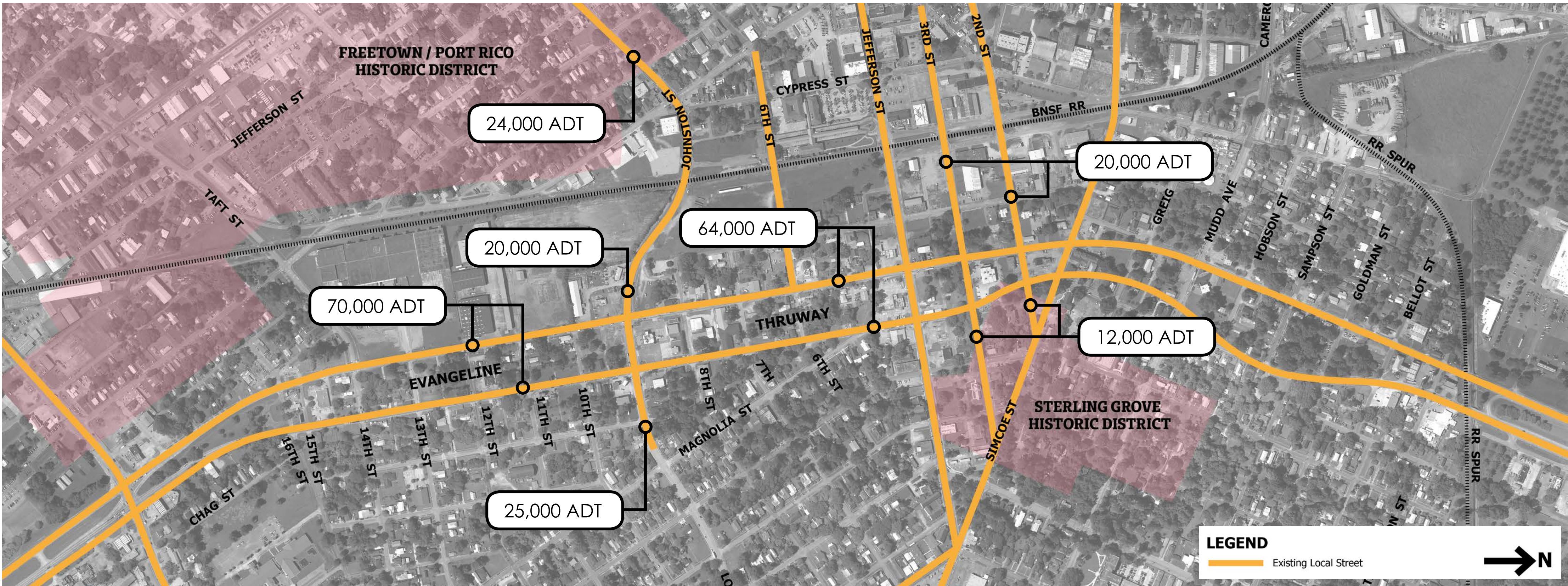
2015 Current ADT Volumes